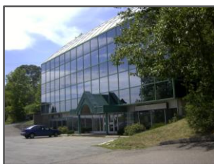
Bedford, Canada Headquarters